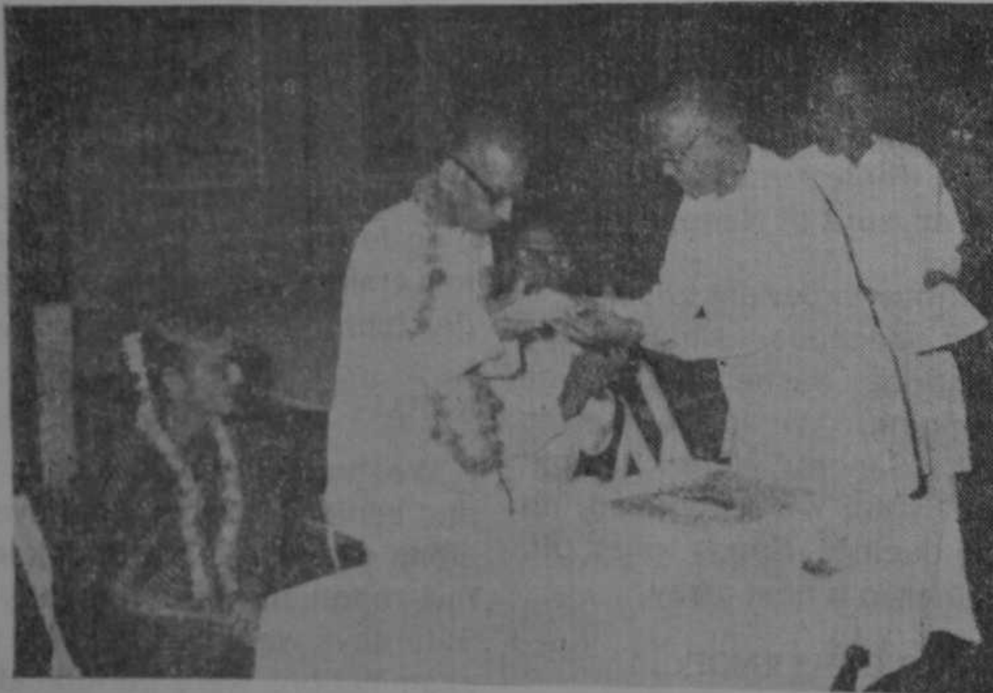
Shanmukhananda Sabha felicitating the Guru on his Satabhishekam

In 1974 Sri Shanmukhananda Fine Arts & Sangeetha Sabha invited him to open a violin department and impart training in their Sangeetha Vidyalaya. He readily agreed and shifted there with all his students. The Sri Krishna Academy was wound up, but rose the Shanmukhananda violin faculty. His methodology, his systematic teaching, his patience, persuasion and perseverance in cultivating interest and knowledge in his students are matters for experience,